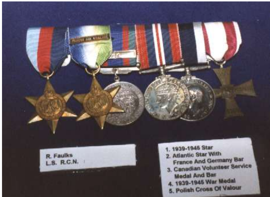
Displayed in the CFB Esquimalt Museum.