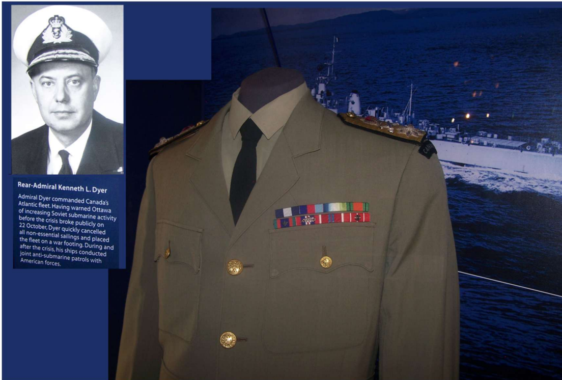
Tunic on display in the War Museum in Ottawa – navy summer uniform

Medals: DSC – 1939/1945 Star – Atlantic Star – Defence – CVSM and Clasp – 1939/45 War Medal with MID – CD and Bar