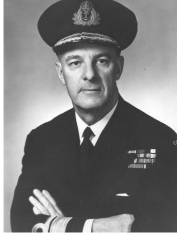
Uniform on Display at CFB Halifax Maritime Museum