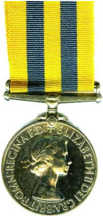
British Issue Korea War Medal

The similar British issue does not have the word 'Canada' at the bottom of the obverse. 1