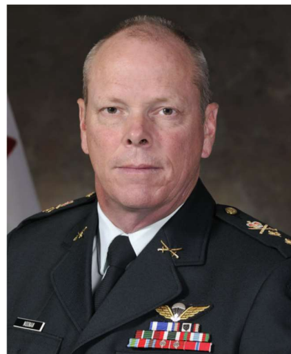
SOUTH WEST ASIA SERVICE MEDAL (ends)