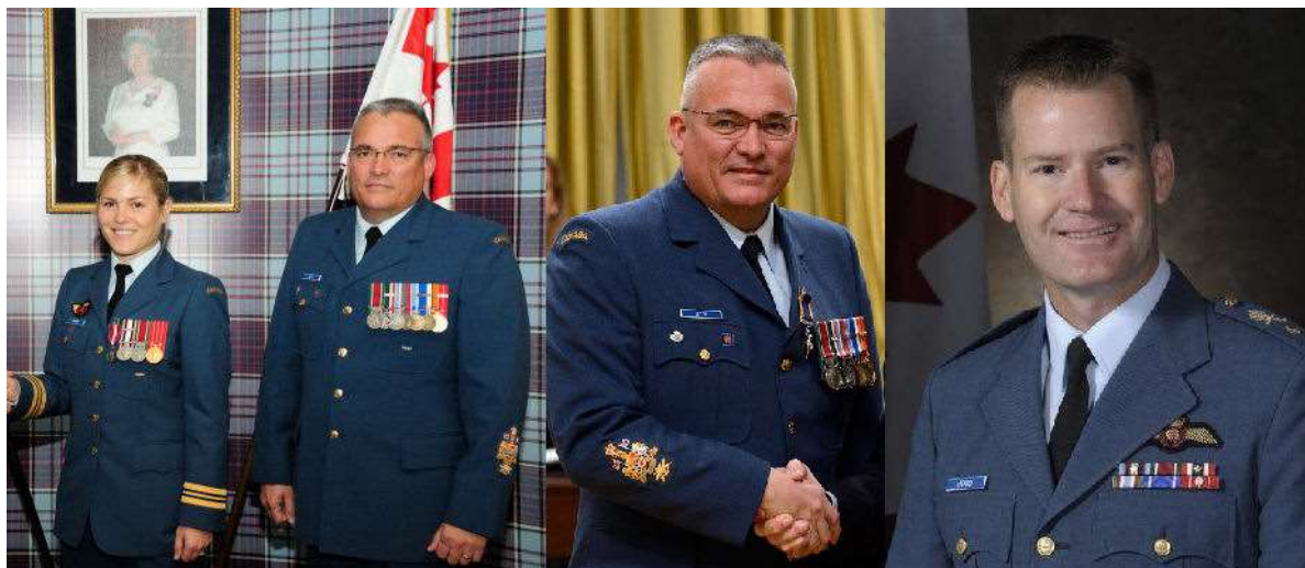
General Service Medal - SWA (ends)