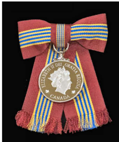
Sovereign's Medal for Volunteers (ended)