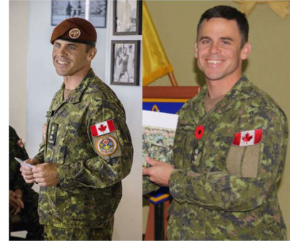
Colonel Leroux when he commanded the MFO and LCol Leroux when he commanded Task Force-Ukraine.

“As commander of Joint Task Force Ukraine, Lieutenant-Colonel Leroux developed a plan to modernize the individual and collective training system, which had a remarkable impact on the professionalization and development of the Ukraine Armed Forces. He also strengthened relations with key allies involved in the field and harmonized the Government of Canada’s contributions in the region. Through innovative thinking, he developed comprehensive, specific and effective options to support the analysis of the evolution of the Canadian Armed Forces mission in Ukraine.”