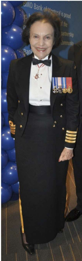
Retired in October 2013 after 17 years as an Honorary Captain(N).

Awarded Officer, Order of Canada awarded as per Canada Gazette of 25 June 1983.