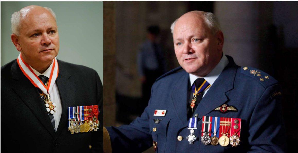
LGen Charles Bouchard, OC, CMM, MSC, CD